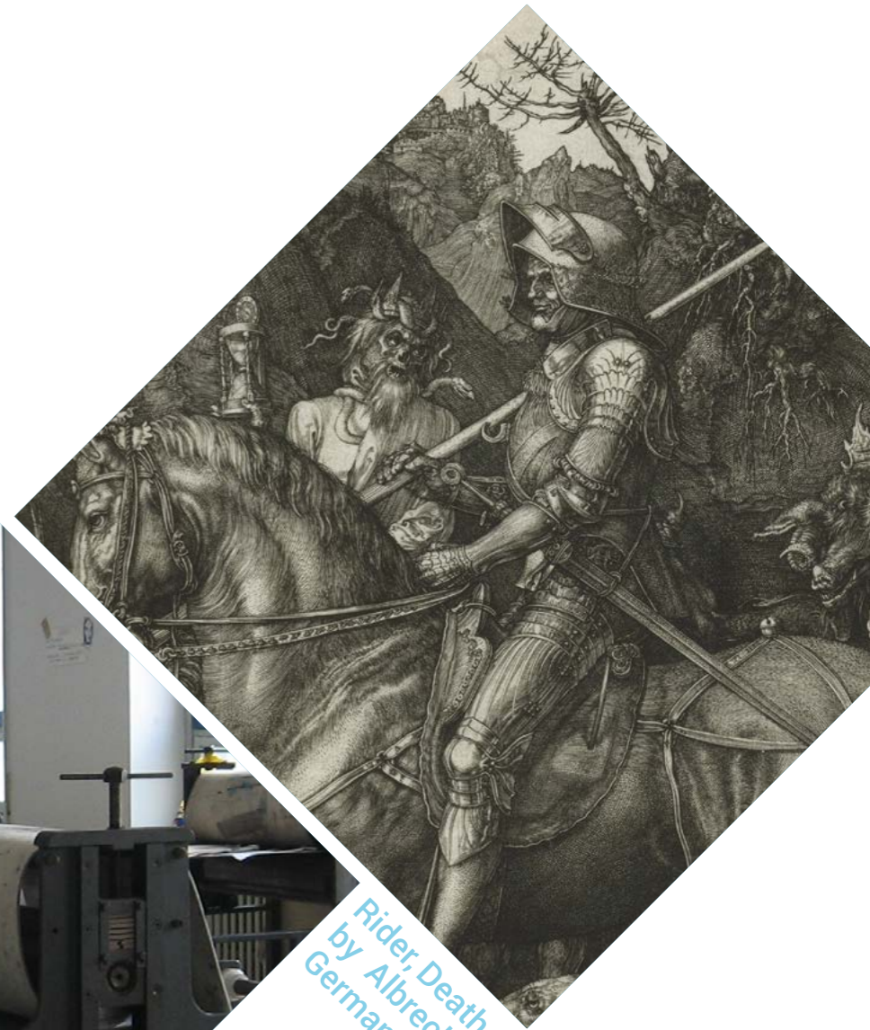
Rider, Death and the Devil, by Albrecht Durer, 1513, German print, engraving